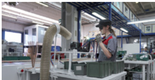
Welding of the condenser to the compressor