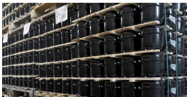
Strategic production components: the compressors